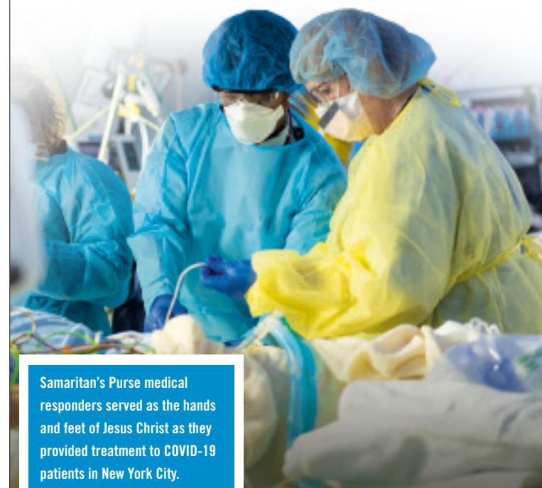
Samaritan’s Purse medical responders served as the hands and feet of Jesus Christ as they provided treatment to COVID-19 patients in New York City.

missionary, I have battled a number of plagues, including Ebola, cholera, diphtheria, and now coronavirus. I believe disease and pestilence are but tools of Satan. As I have read the Bible, I know he will be defeated. In the midst of my past encounters and intense struggles with these deadly diseases, I am always reminded of the encouraging words from Psalm 91:9-10: “Because you have made the Lord, who is my refuge, even the Most High, your dwelling place, no evil shall befall you, nor shall any plague come near your dwelling.” 🌐